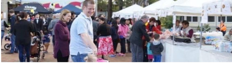
1015 Lantern Night