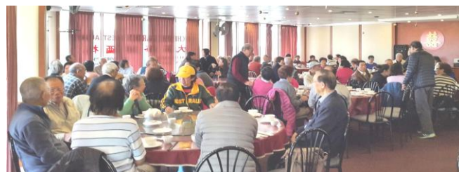
Hundreds Seniors Lunch

On 15 th June (Wednesday), the "Hundred Seniors Lunch" was held at Lee Central Park Chinese Restaurant, Thornleigh. There were nine tables organised this year.