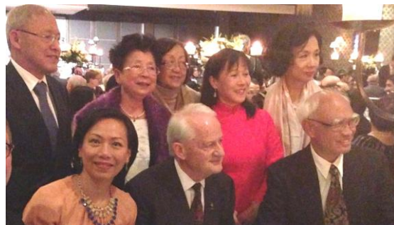
Philip Ruddock Tribute Dinner